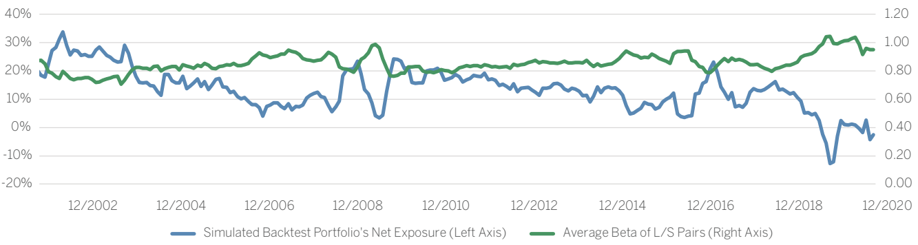
EXHIBIT 4 Hypothetical back-test portfolio

The data shown is hypothetical, back-tested data. See last page for important details. Net exposure refers to the weight of the long positions less the weight of the short positions. Source: FactSet. From March 2001 to December 2020.