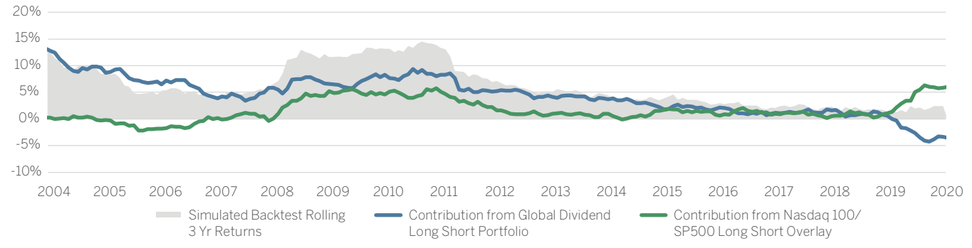
EXHIBIT 5 3-Year rolling return of hypothetical back test and contribution from long/short sleeves

Past performance is no guarantee of future results.