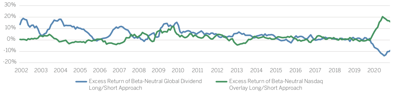
EXHIBIT 6 Excess return of the global high-dividend long/short portfolio versus the excess return of the Nasdaq long/short overlay (1 year rolling returns)

Past performance is no guarantee of future results.